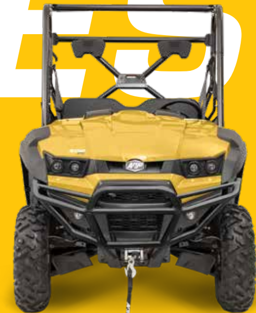
MAGNUM PRO XTX

ARGO. THE DIFFERENCE BETWEEN CAN AND CAN'T FOR OVER 55 YEARS.