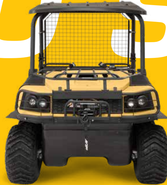
CONQUEST PRO XTL