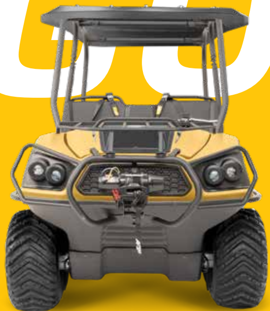
AURORA PRO XT