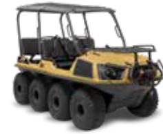
AURORA PRO 800 XT 8x8