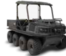
CONQUEST PRO 950 XTX 8x8