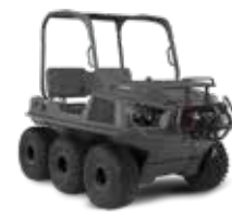
FRONTIER PRO 700 XT 8x6