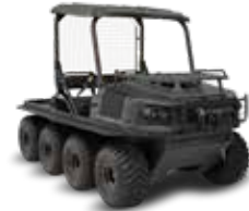
CONQUEST PRO 950 XTL 8x8