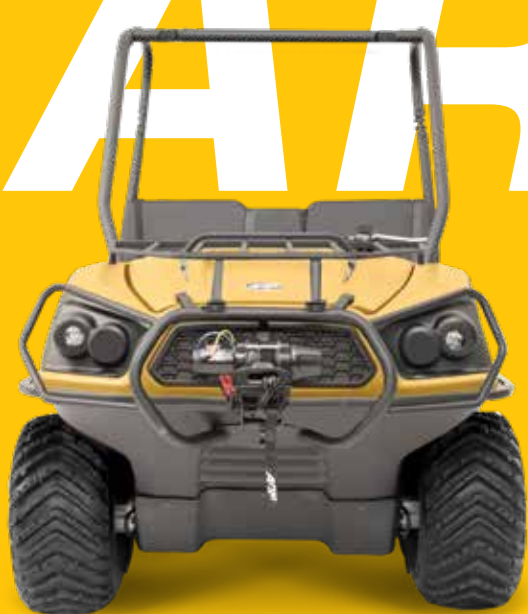
FRONTIER PRO XT