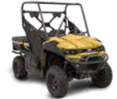
MAGNUM PRO 500 XTX