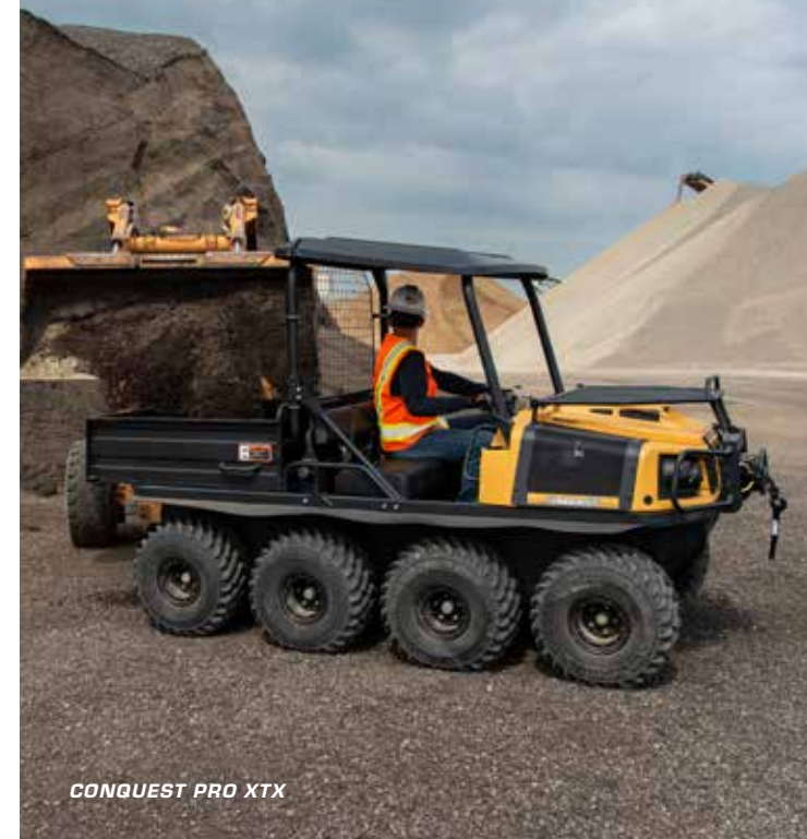
CONQUEST PRO XTX

In this corner is pure power. The ARGO Conquest Pro XTL/XTX is not only the heavy-duty workhorse series; each model is a reliable champ that brings its own vibrant personality and durable features to take on any obstacle. The Conquest Pro XTL/XTX are built to win with their unmatched V-Twin determination and our certified Roll-Over Protection Structure (ROPS). The lineup exudes confidence and is ready to crush challenges with a sense of adventure. If you need a trusted work partner that adds excitement to the daily grind, one of these Conquest Pro models should be your next hire. Let the Conquest Pro lead the way safely with its monster performance and unmistakable hard-work ethic.