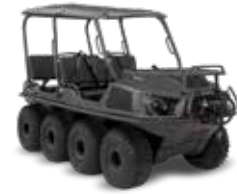
AURORA PRO 950 XT 8x8