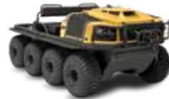
CONQUEST PRO 800 XT 8x8