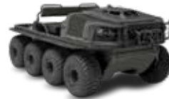
CONQUEST PRO 950 XT 8x8