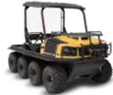
CONQUEST PRO 800 XTL 8x8