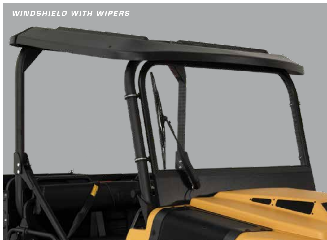
WINDSHIELD WITH WIPERS