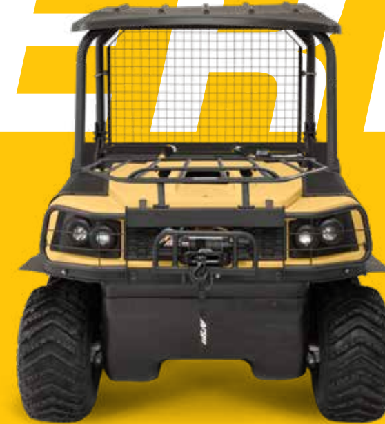
CONQUEST PRO XTX