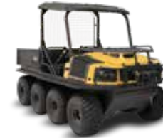
CONQUEST PRO 800 XTX 8x8