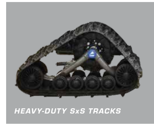
HEAVY-DUTY SxS TRACKS