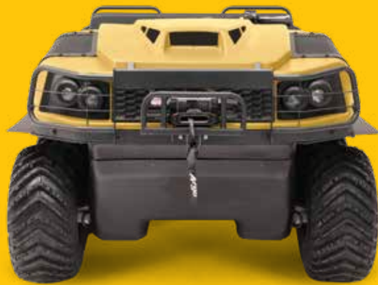
CONQUEST PRO XT